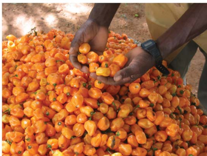
High-value Habanero hot peppers grow beautifully in the African Market Garden.

Most African cities are located near a major water supply, and high-value vegetables are grown nearby by thousands of small-farm entrepreneurs in hand bucket-irrigated 'market gardens.' These gardens are strategic intervention points for development, because irrigation opens many agricultural opportunities, and cities are gateways to regional and international commerce.