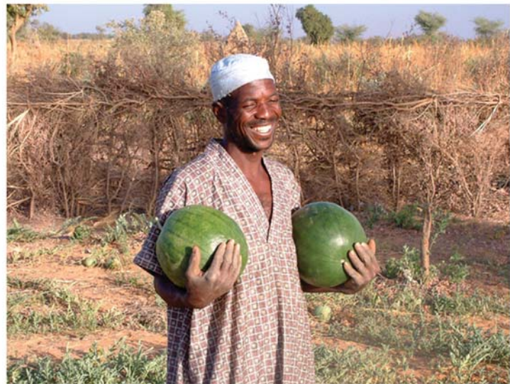
By improving soil fertility and rainfall capture, crops like watermelon can thrive even in the sandy soils of the Sahel.

There are three main ingredients to a model we call the 'Sahelian Eco-farm', which can multiply dryland farmers' net income by a factor of six while restoring soil health. Because dry areas have less plant vegetation on the surface, their soils tend to be very low in organic matter and depleted of nutrients. We are finding that we can correct these deficiencies by planting hedgerows of special drought-tolerant, nitrogen-fixing trees such as Acacia coleii . The leaf litter as well as decaying roots add organic matter to the soil and also reduce wind erosion and increase water infiltration. Small amounts of fertilizer complement the organic matter, and crop yields are boosted substantially.