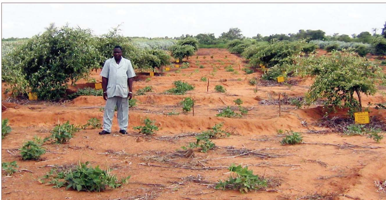
The Sahelian Eco-farm stays green long after the rains have ended. High-value Pomme du Sahel fruit trees thrive because rainwater channeled to them by the bund system continues to be tapped by their deep roots. Improved cowpeas between the trees grow on residual moisture. Greyish leaves surrounding the field are the soil-building tree Acacia colei .

Higher incomes can also be wrested from some of our traditional crops through plant breeding. Disease and drought-resistant pigeonpeas yield abundantly and are exported to India, providing farmers with a live-saving backup when droughts wreck their maize crops in eastern and southern Africa. Groundnuts have export potential to Europe when aflatoxin is controlled, as in our Malawi partnership. Cowpeas (which we are studying in partnership with IITA) can earn farmers three times more than millet, and their stems are in high demand to feed hungry livestock across the Sahel.