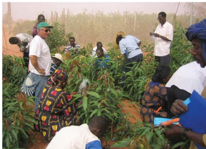
Trainees learn how to graft higher-value mango stems onto locally-adapted rootstocks.

But they must be profitable in order to motivate people to plant them. An example is Acacia senegal , which produces the commercial product 'gum arabic', which is exported globally. We are selecting high-yielding trees to be grown by communities in plantations that return a good income while renovating ruined lands. Other promising trees being studied include tamarix ( Tamarix aphylla ), mango, jatropha ( Jatropha curcas ), boscia ( Boscia senegalensis ) and more.